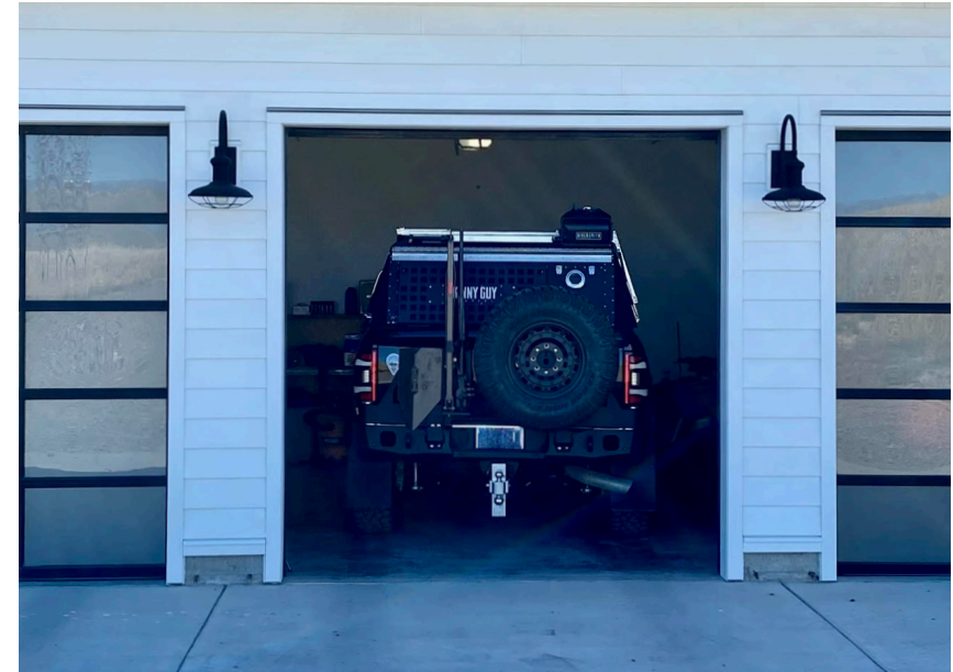
CAB-HIGH AND GARAGEABLE, SELF-CONTAINED TRUCK BED CAMPERS WITH HEAT, LIGHT, POWER, AND LIGHT.