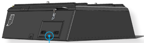
Exterior Baggage Door

Model 5.0 - 345 lbs Model 5.0 GLR - 345 lbs Model 5.5 - 400 lbs Model 6.0 - 420 lbs Model 6.5 - 425 lbs Model 8.0 - 530 lbs